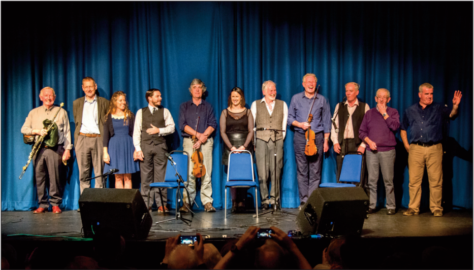
The performers take a curtain call at the Ace & Deuce of Piping concert

Our annual ACE AND DEUCE OF PIPING concert was once again held in Liberty Hall in October. This concert featured music, song and dance from some of the best artists in the tradition. The 2016 lineup was as follows;