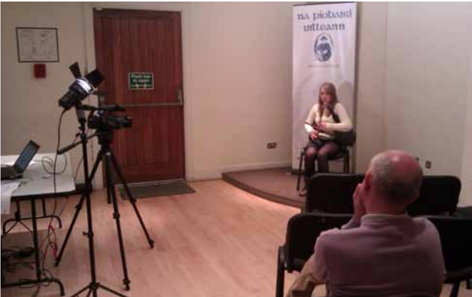
TOP TO BOTTOM, LEFT TO RIGHT: DERRY, ACHILL, CHICAGO, DUBLIN