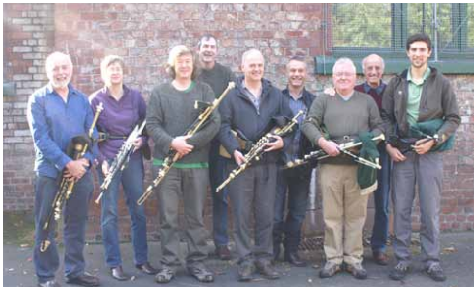
TOP TO BOTTOM, LEFT TO RIGHT: GALWAY, GALWAY, SINGAPORE, MANCHESTER